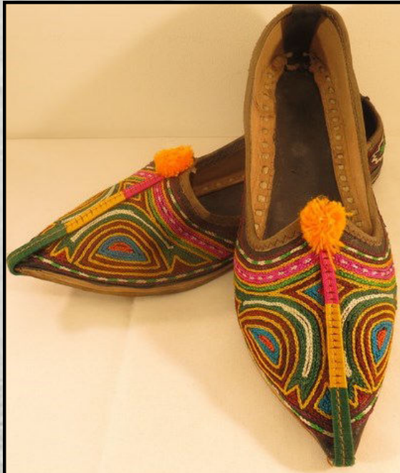
MEN LEATHER MOJARI Price Range: 450 INR Onwards