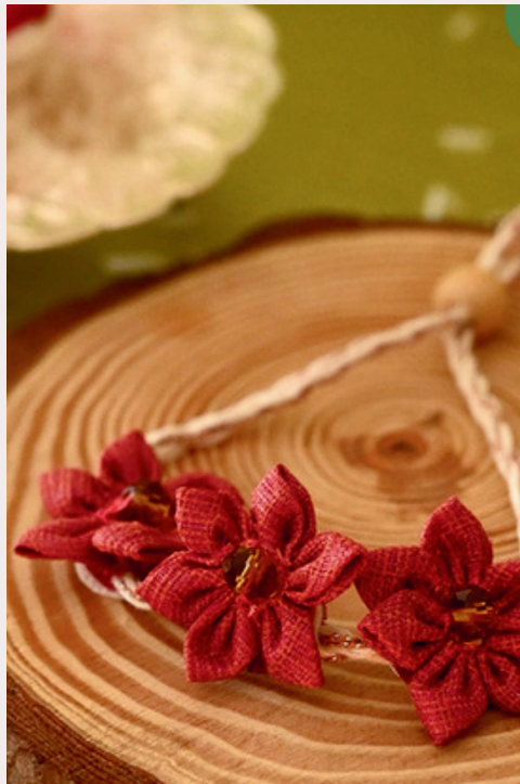
SKU CODE : FABRIC -RAKHI-6