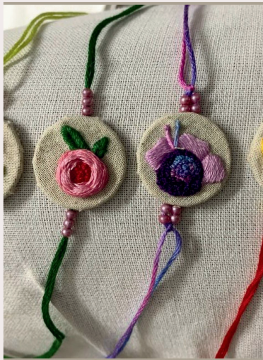
SKU CODE : FABRIC -RAKHI-5