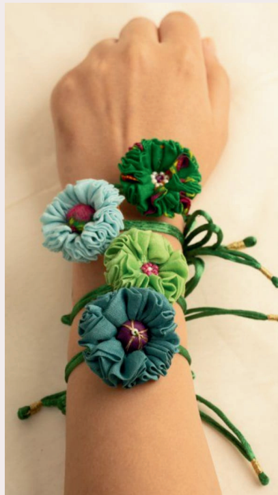
SKU CODE : FABRIC - RAKHI-7